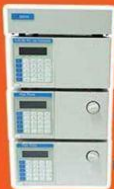
HPLC Liquid Chromatography